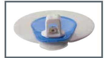
F = 3 mm fitting