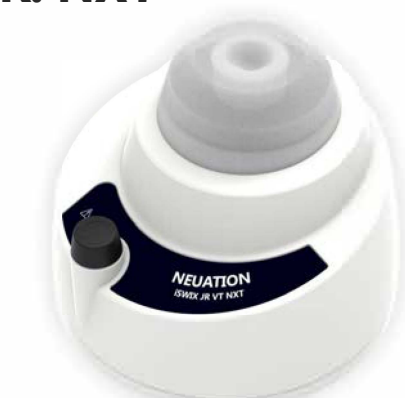
iSWIX JR. VT NXT