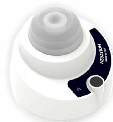
iSWIX JR. NXT