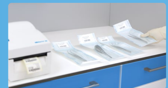
✓ Marking with MELAprint 80