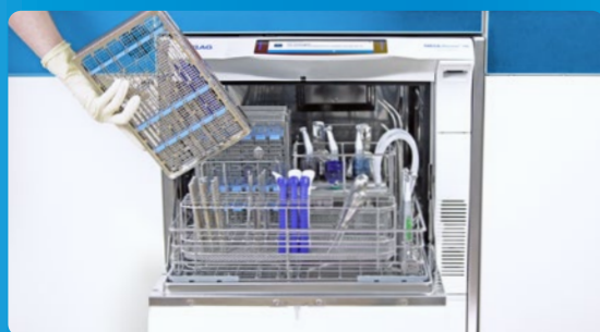
✓ Cleaning & disinfection with MELAtherm

Unique as a product, unbeatable in a system: