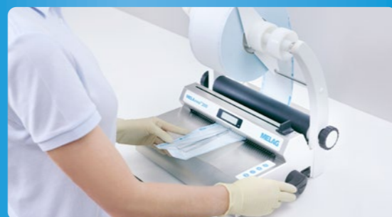
✓ Packaging with MELAseal or MELAstore