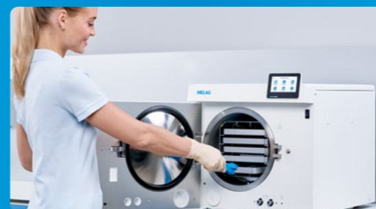
✓ Steam sterilization with Vacuclave