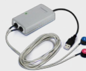
AngE™ Phlebo 2-channel PPG with Temperature