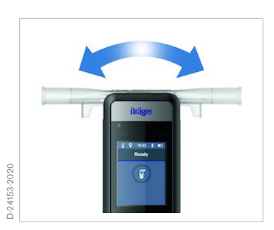
Mouthpiece receptacle can be mounted on left or right