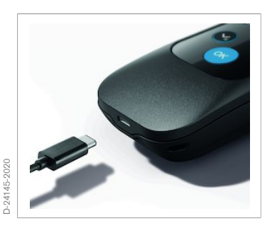
USB-C interface for easy downloading (while stationary or on the move)