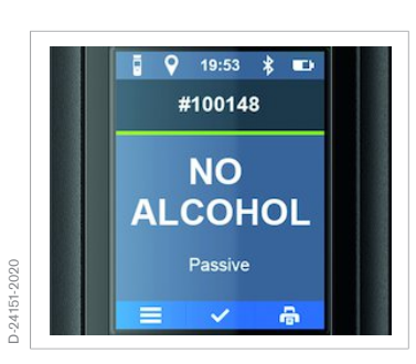
The 2.4" colour display provides information, notices and warnings