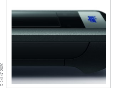
Rubberised handling area for a secure grip