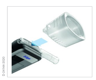
Fast switchover from funnel-based to mouthpiece-based testing