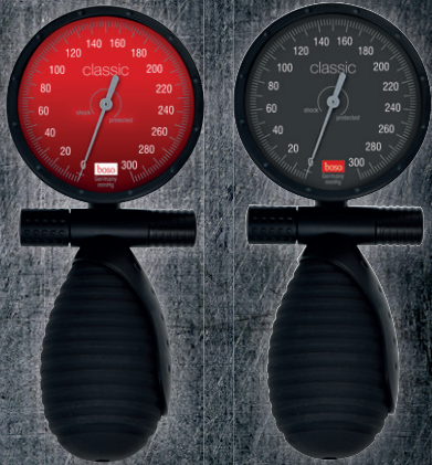
boso classic merkur RS matt black, red deal

- Premium blood pressure instruments since 1922 -