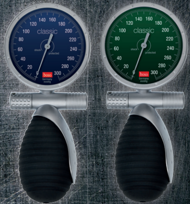
boso classic saturn BS matt chrome, darkblue deal